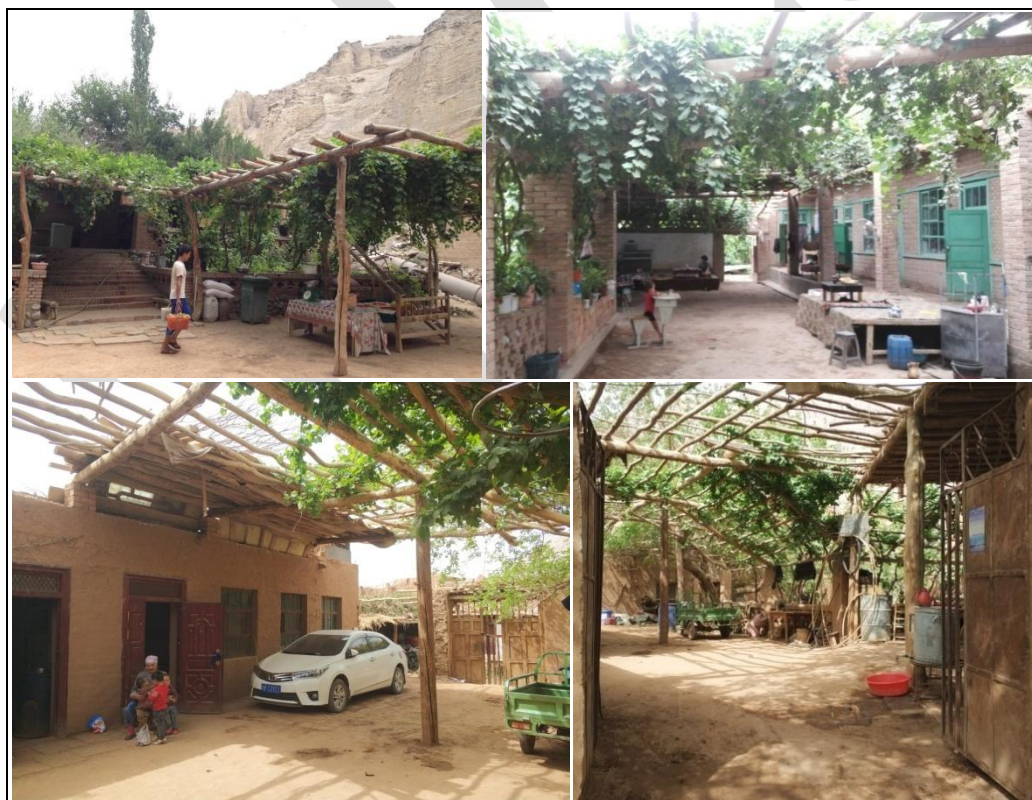
Figures 2 Construction of shade space in the courtyard of Grape village.

As shown in figure 2, the courtyard under the grape trellis is often the most frequently used space in spring and summer. The excellent scaffolding and the building facade surround the indoor and outdoor transition space, which organises and connects other spaces in the courtyard. The experience of this kind of oasis micro space is vivid and clear. The courtyard space of folk houses in Turpan offers shade to people for the hot summer, forming the second living room and second bedroom: the living room during the day, the bedroom at night, and the ample space in family life, with comfort,