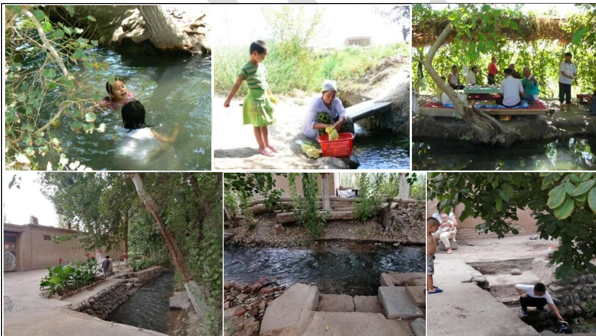
Figures 3 Construction of near-water and hydrophilic space in Grape village.

The streets and alleys associated with the grape cultural landscape are spatially shaped by closed, bare soil courtyard walls and grape scaffolding along the streets and alleys—the best place for nearby residents to relieve summer heat in summer. A single courtyard is a more familiar local courtyard system. Towards a unified flat courtyard organization facing artificial canals will be gurgling canals in front of each house, as shown in Figures 3. It is convenient to get water in daily life. Those who live far away from the canal bank put beds and houses under the house as a place to rest at night. The open-channel flows, the water gurgles, the central canal system connects with the branch canal, the overflow system runs along the streets and lanes, and the clear water surface with different widths has become a place for children to play by the stream in summer (Yuan Kang & Wang, 2019 121-125). Daily activities such as water collection and raccoon washing along the canal, the water logging dam space form a gathering place for residents, which constitutes a vivid daily water landscape under the oasis pattern in arid areas, which is also the essential feature that distinguishes it from other oasis rural landscapes. Residents have established a beautiful and fertile water landscape and a beautiful oasis garden.