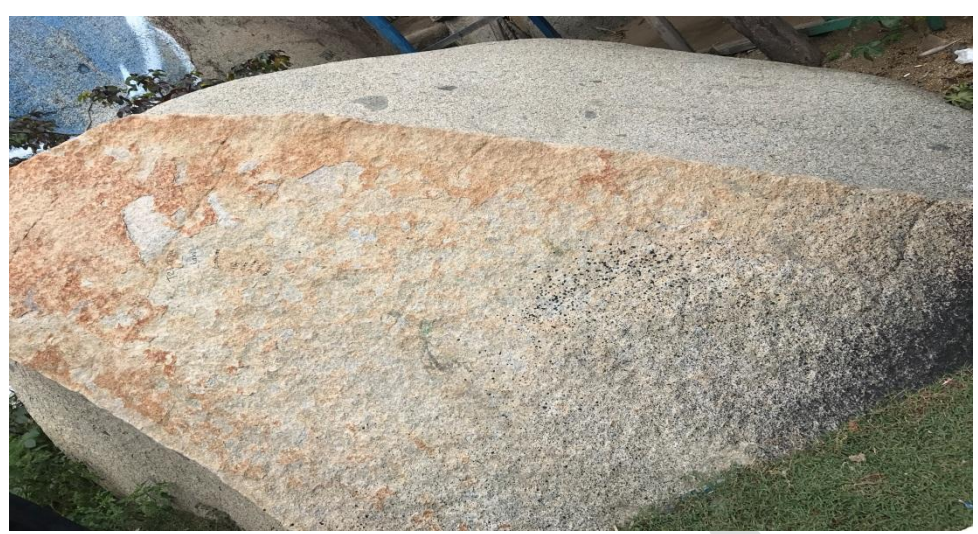
Figure 2. Lahilote footprint site

The focus of this study was the social facts on the difference between two groups of the community, the upper class and the lower class, the habituated culture, and the existing values.